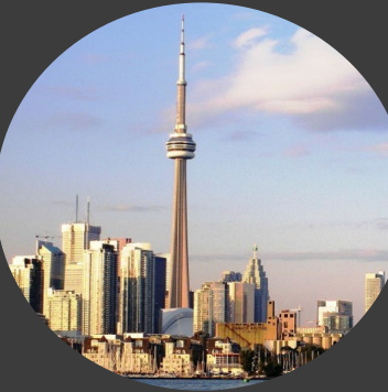
Toronto - ON