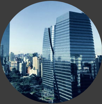
São Paulo - SP