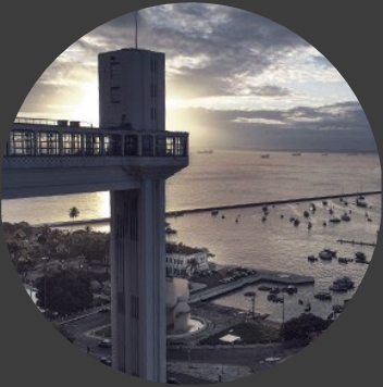
Salvador - BA