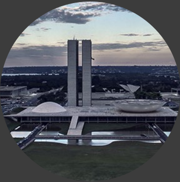
Brasília - DF