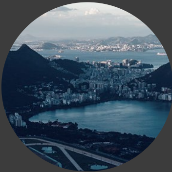
Rio de Janeiro - RJ