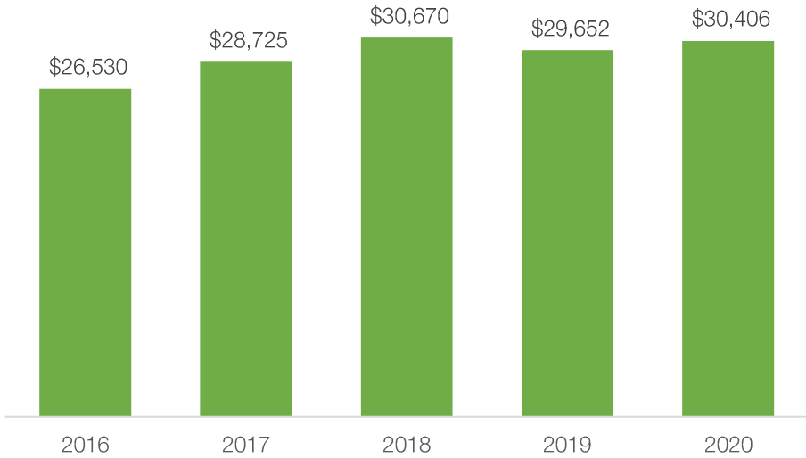
Total Saskatchewan Goods Exports, 2016-20 (CAD Millions)*

In 2020, Saskatchewan goods exports reached $30.41 billion.